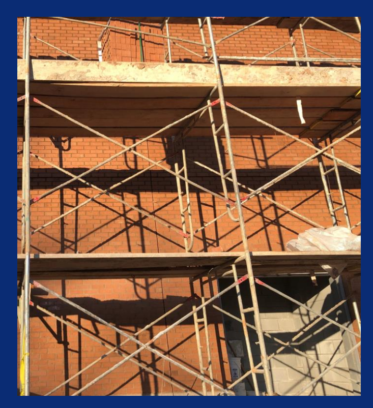
Exterior brick installed on lower level south wall