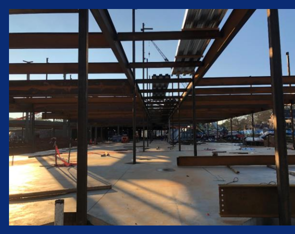
Corridor C3-2 on main level east looking west